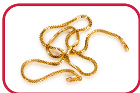
Silver or Gold Chain